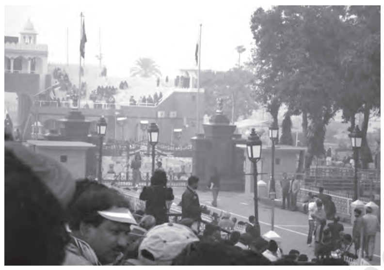
Fig. 8.1 Wagah Border is not only a tourist place but also used for trade between India and Pakistan

goods. At this stage, enterprises owned by government (known as State Owned Enterprises—SOEs), which we, India, call public sector enterprises, were made to face competition. The reform process also involved dual pricing. This means fixing the prices in two ways; farmers and industrial units were required to buy and sell fixed quantities of inputs and outputs on the basis of prices fixed by the government and the rest were purchased and sold at market prices. Over the years, as production increased, the proportion of goods or inputs transacted in the market also increased. In order to attract foreign investors, special economic zones were set up.